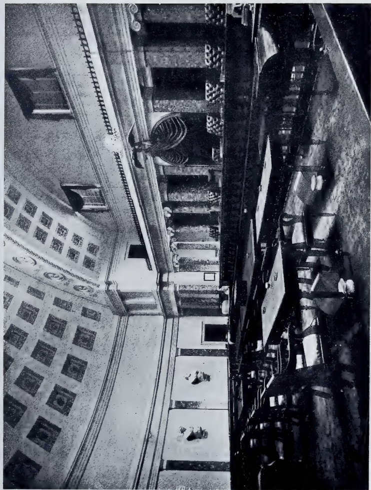
THE PRESENT COURT-ROOM